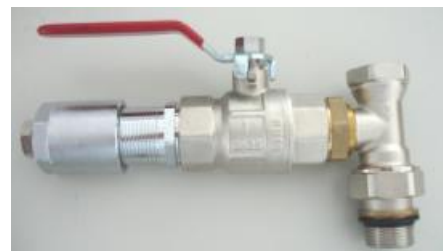
Connect with the valve body